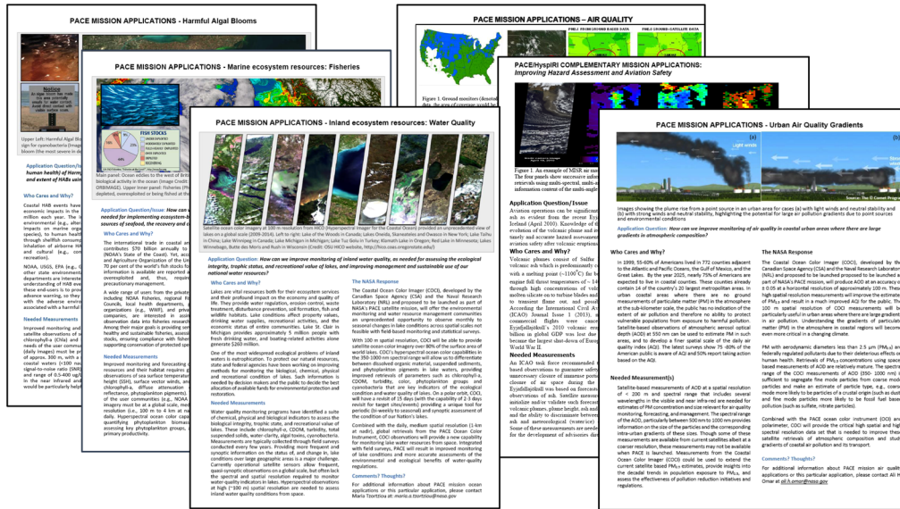
Fig. 3 Examples of one-page white papers on specific PACE applications. These one page communiques present the application question/issue, why it is important, the needed measurements and the NASA response for both atmosphere and ocean products of PACE.

because the two groups (practitioners and scientists) will need to work together to maximize the benefits of these products. The PACE mission will identify and engage potential user communities (Communities of Practice) early in the PACE mission design and development process, to ensure that the product suite and delivery mechanisms maximize the usefulness and societal value of PACE observations. Specific outreach activities, community engagement strategies such as the use of succinct one-page white papers shown in Fig. 3, and community engagement approaches have commenced. The objective of these communication strategies is to demonstrate the value of PACE products across a wide range of practical application areas and foster interactions between the PACE program, project team, science teams, operational users, resource managers, policy makers, and other relevant stakeholders.