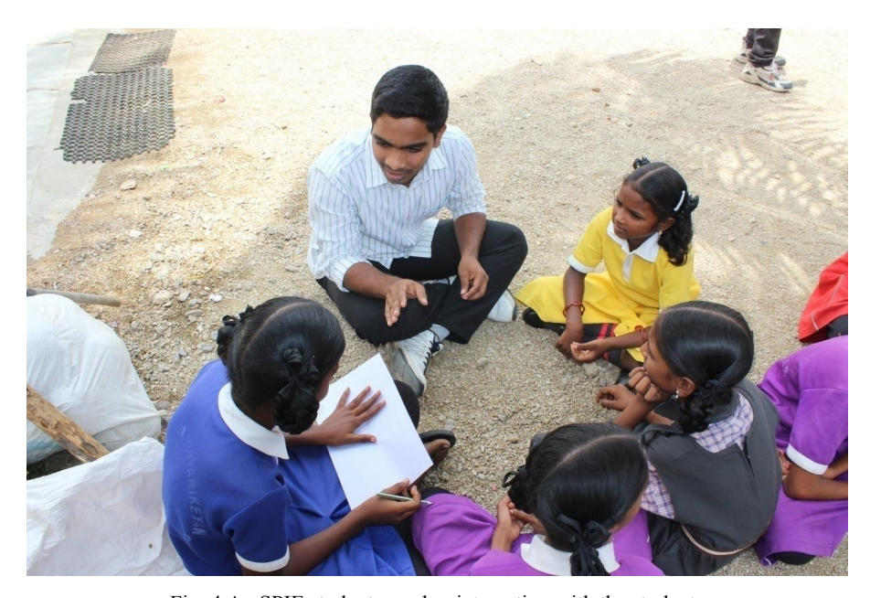
Fig. 4 An SPIE student member interacting with the students