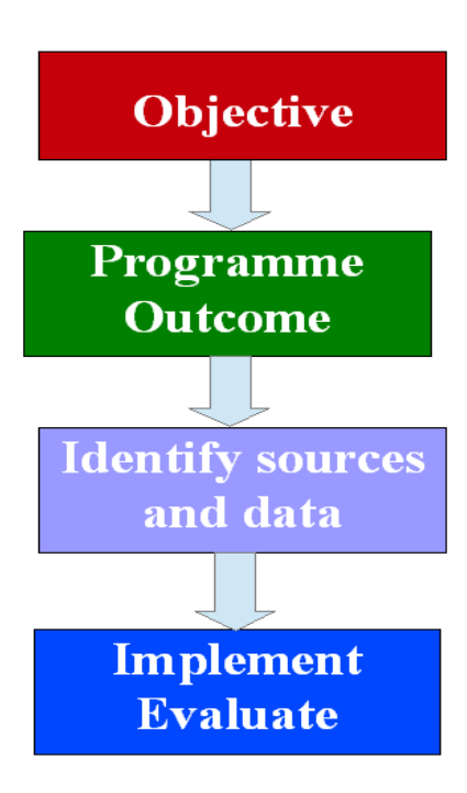
Fig. 1 Represents the flow chart of outcome based education