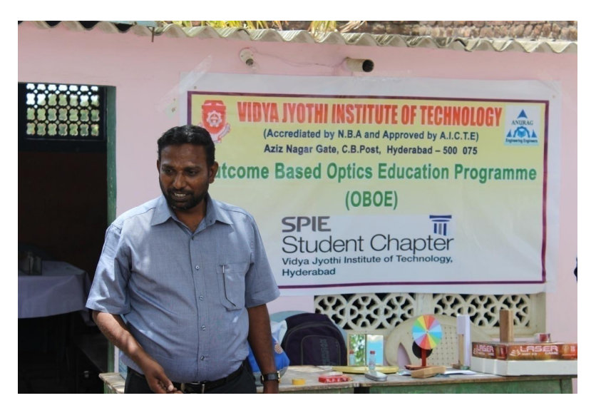
Fig. 2 A brief introduction being given to the students

Materials such as plane mirrors (reflection), cardboard with holes (linear propagation of light), Water tank (refraction), laser light, ordinary torch lights (sources of light), transparent sheets (object: Transparent to light), oil paper (Object: Translucent), card boards (Object: Opaque), papers (to prepare the designs), batteries, connecting wires, LEDs were used for demonstration by the SPIE student chapter members. The students were provided with KHET – a laser game kit, given by SPIE to show that learning optics is fun.