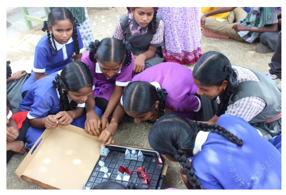
Fig. 5 Students engrossed in playing the laser game