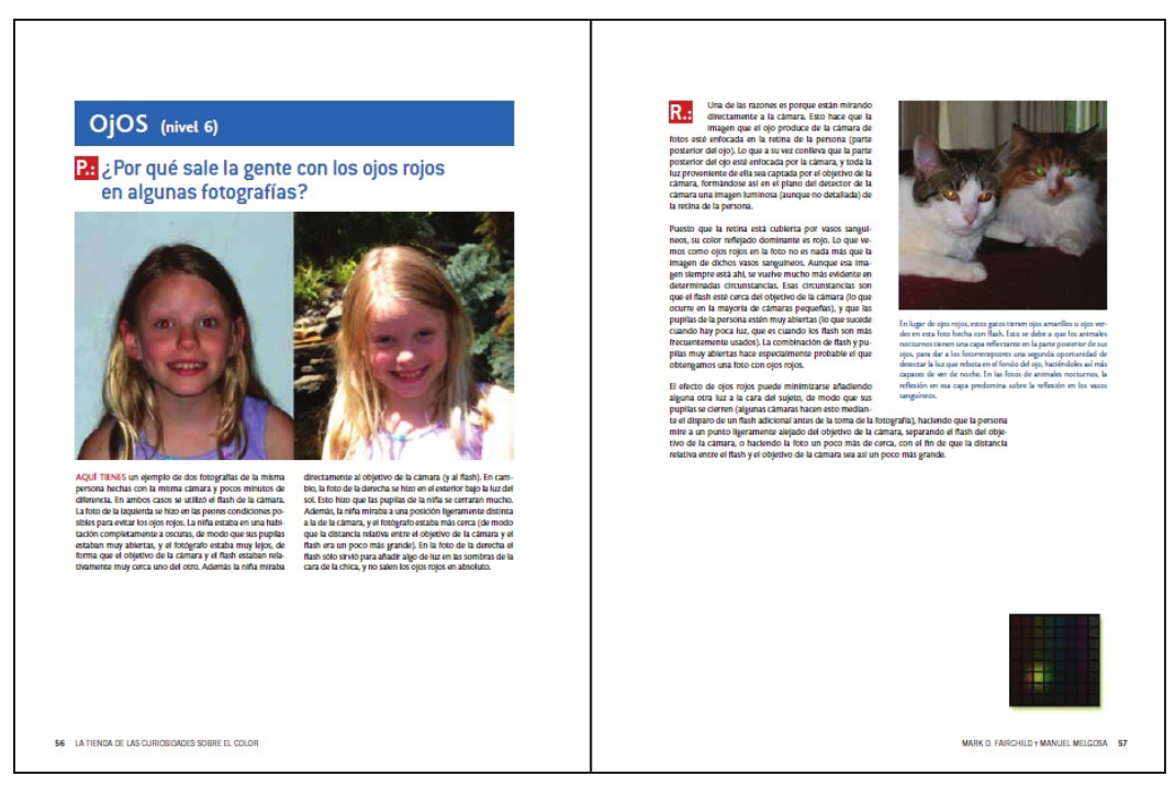
Figure 2. Example of one of the questions in the book "La tienda de las curiosidades sobre el color": "Why do people get red-eye in photographs?" (Eyes, level 6).

To give an idea of the materials we are suggesting here, Figure 2 gives an example of one of the modules in the book in Spanish language, the one corresponding to the question "Why do people get red-eye in photographs?" (Eyes, level 6). As you can see, as for any other question the answer is illustrated by 2 photographs with their corresponding legends, and the position of the question in the whole book is indicated by the colored square in the bottom right corner.