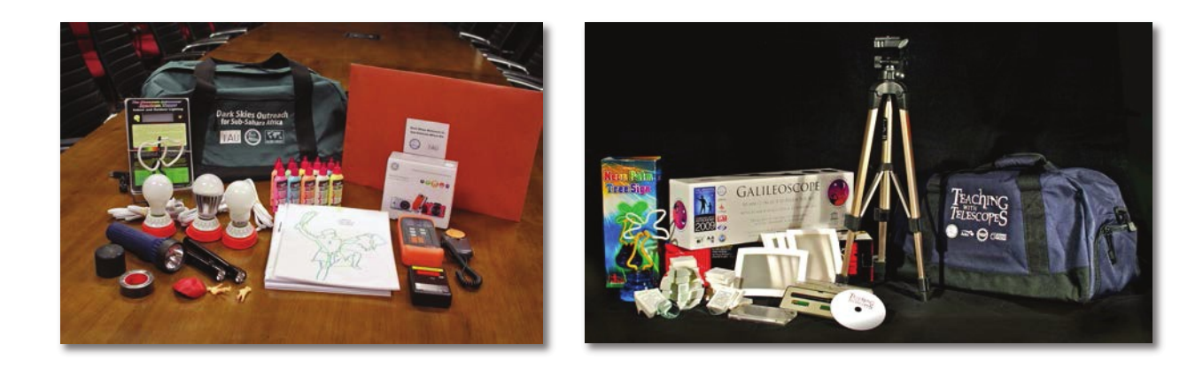
Figure 2: Left: Dark Skies/Illumination teaching kit for outreach to Sub-Saharan Africa. Right: Galileoscope teaching kit for 5<sup>th</sup> grade classroom teachers.

A closer look at the evolution of these programs shows that NOAO has taken on optics education projects with many varied audiences. We have also been able to design programs that serve many different audiences. When new materials need to be developed NOAO has developed and tested kits. NOAO has developed expertise in educational kit development. For example, a portion of the kit for the last project described in the previous table is shown in Figure 2.