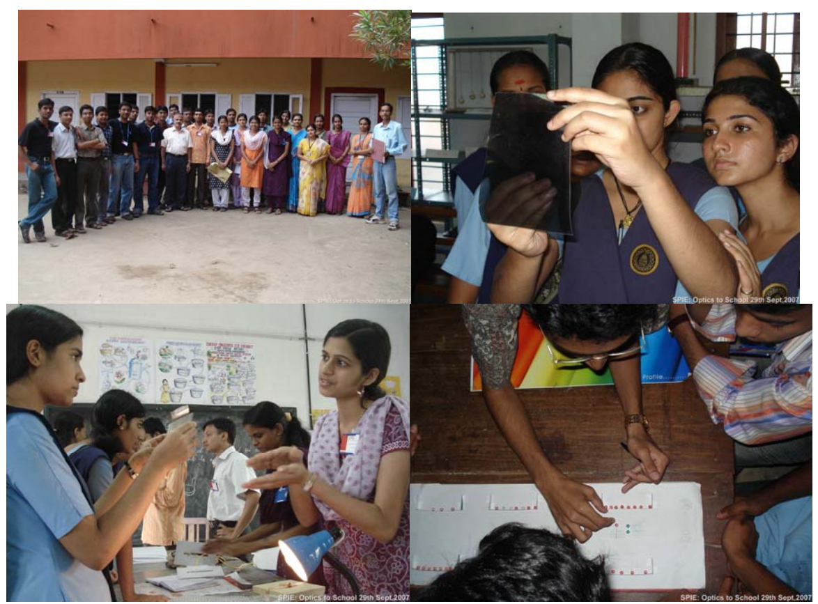
Figure 2: Photos of Optics to School program

This program is designed to run as a whole day program in a school. A group involving 20 to 30 volunteers would go to the school and setup the experiments mentioned in the previous section, depending on the target audience. The program starts with a presentation in order to introduce the students to the objective of this program. Also students would be shows presentation of various fascinating development happening in the field of optics and Photonics at present.