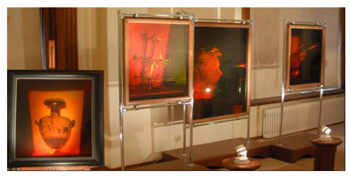
Fig.5. Part of the first hall holographic collection