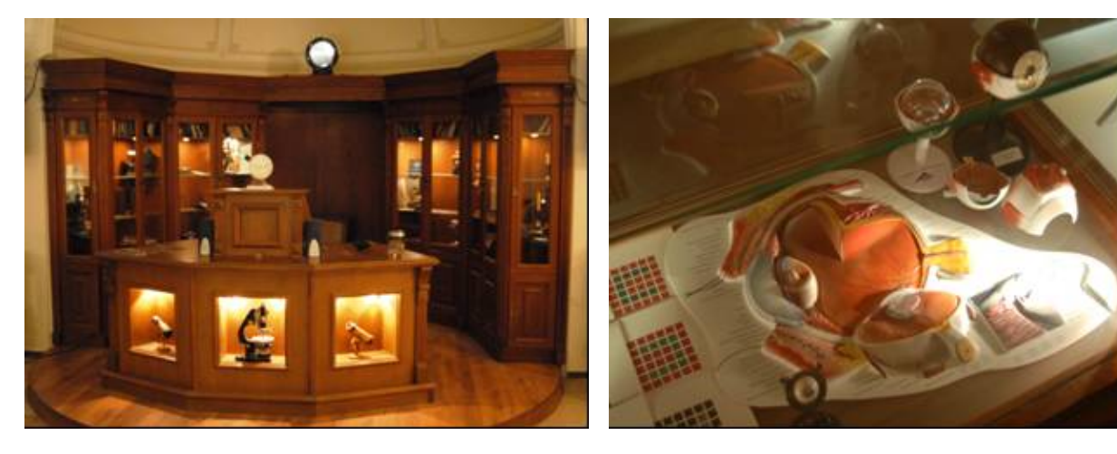
Fig.6. Centre view of the second hall