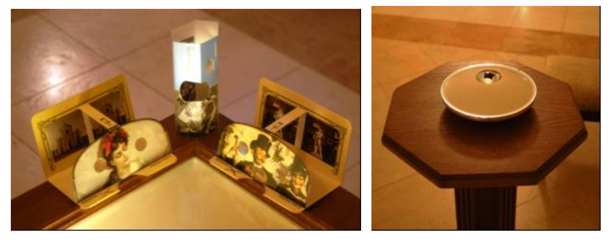
Fig.1. Examples of simplest stereoscopes

This entire educational complex based on a combination of education, research activities and games, and having a clear business plan, should become, in our view, the prototype of the centers attracting young people to science and technology, whether to optics, aerodynamics or acoustics.