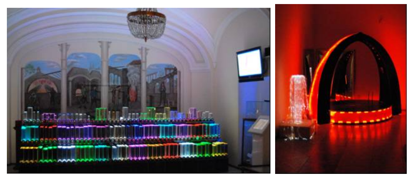
Fig.9. View of famous Abbe-catalog