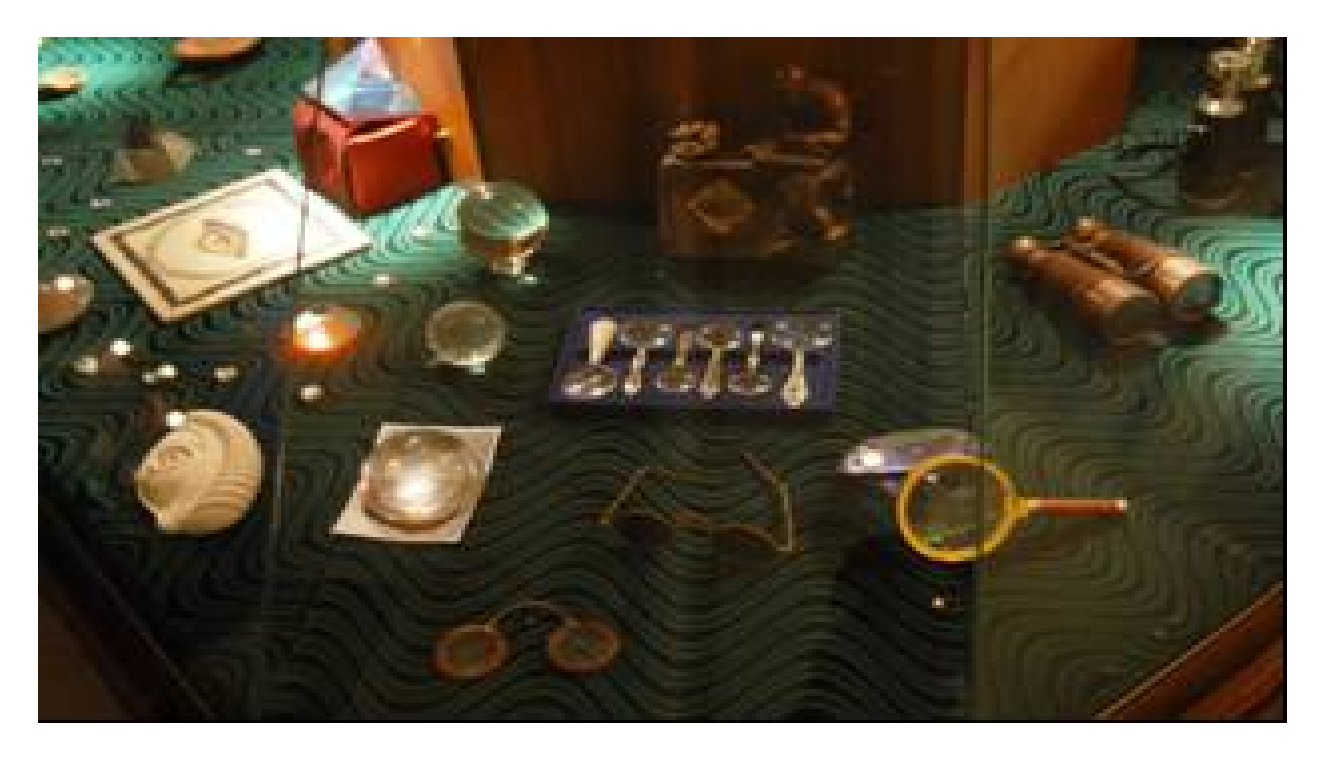
Fig.8. Ancient crystal balls, reading stones & glasses