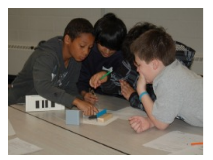
Figure 2. top: Fifth grade students make the cardboard tube spectroscope from the PHOTON Explorations and use it to study the emission spectra of various light sources. Bottom: Protractors are used to line up a "shot" taken with a laser pointer in the Mirror Challenge from Hands-on-Optics.