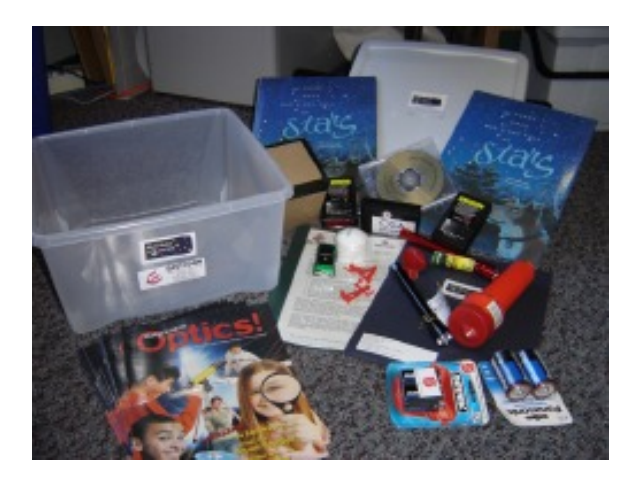
Figure 3. The Dark Skies activity kit

Future Dark Skies at EASTCONN plans include an ongoing study of the brightness of the nighttime sky with an ever-expanding group of students. In addition, in celebration of the Year of Astronomy, students will be making Galileoscopes in an online class. Dark Skies at EASTCONN is unique because students engage in authentic scientific study while also enhancing their global awareness through an international partnership and study of the nighttime sky. To date, two high schools, two colleges and four elementary schools in the US and their partner schools in have taken part in Dark Skies at EASTCONN.