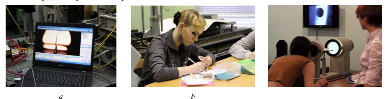
Fig. 7 The practical tasks: a) the question about the optical phenomenon; b) the question about the optical elements; c) the question about the optical testing method.

The number of tasks in practical tour depends on the number of the participants. It can be the question about optical element, optical testing method and adjustment of devices and so on. The questions include some explanation about the device and explanations of the task so the participants who see the device or the phenomenon for the first time are able to understand the task using their basic knowledge. The participants have some time after the explanation and presenting the question to give their answers in written form. If the number of participants is not so great the practical tasks can be connected with practical working with some optical device. For example, measuring some specimen using biological microscope. The task was to choose appropriate objective, do measurement of the object and evaluate the error. On the figure 7 the photos of the practical tour are shown.