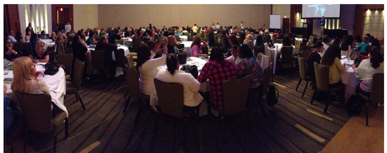
Figure 3. A view of the PRPI Teachers Workshop, at the Puerto Rico Math-Science Partnerships Congress, 22 November 2014 in Fajardo, PR.

PRPI has carried out three teachers' workshops sponsored by the Puerto Rico Department of Education Math-Science Partnerships program. In these workshops, we utilize kits such as the OSA Optics Suitcase for hands-on activities. We couple these with a subset of the demos we offer to schools, described above. Through this program, PRPI has reached over 500 math and science teachers from public and private primary and secondary schools. In Figure 3 we show the scene at the Conquistador Hotel in Fajardo Puerto Rico during our workshop on 22 November 2014.