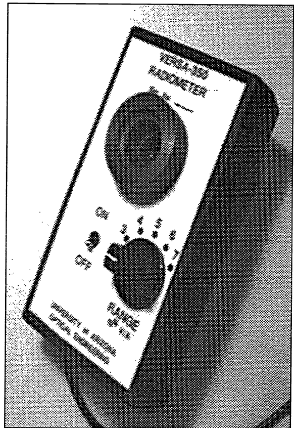
Figure 2. The VERSA-350 Radiometer

The VERSA-350 radiometer (Figure 2) was designed as a multi-purpose instrument to demonstrate fundamental radiometric principles. It includes two detectors (plug interchangeable), one a photovoltaic (PV) silicon (Si) device responding in the visible and near-IR regions of the optical spectrum, and the other a photoconductive (PC) cadmium sulfide (CdS) device with response restricted to the visible. A black anodized aluminum ring allows mounting accessory filters, diffusers, tubes, etc. The electronics, which are mounted on a custom etched-circuit board, provides bias for the PC detector and for the PV detector when reverse-biased. The transimpedance amplifier (TIA) has normal ranges from 10^3 to 10^7 and features a TEST position that can be used for an additional experimental gain component (such as an integrating capacitor) or for assessing the health of the radiometer. All internal gain resistors are 1% metal film. The radiometer is powered by two internal 9V alkaline transistor batteries and the internal supplies are regulated to \pm 5V . The output cable plugs into any standard DMM with banana jacks (0.75" spacing.)