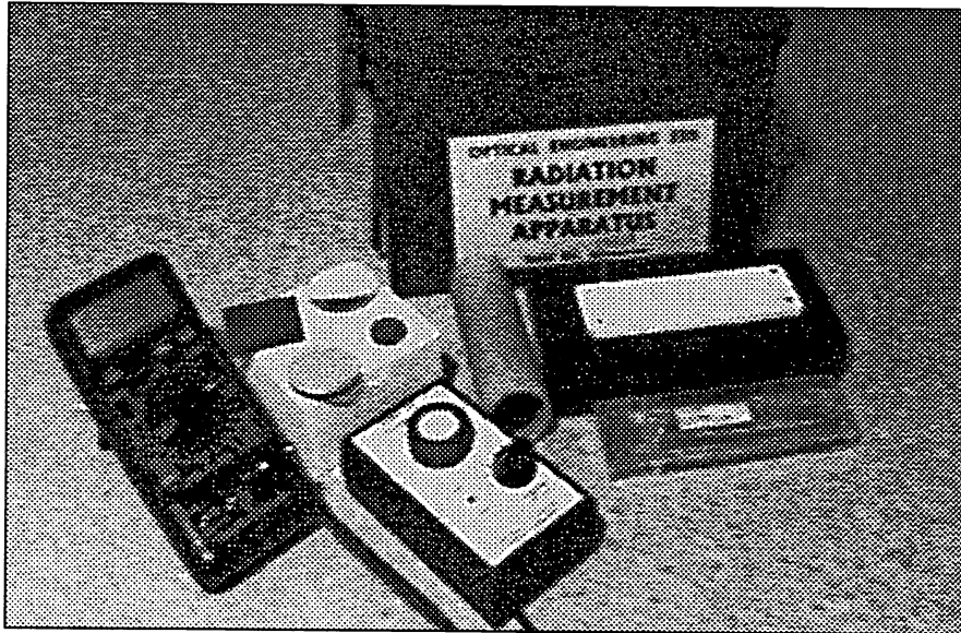
Figure 1 Portable radiometry laboratory

The VERSA-350 radiometer (Figure 2) was designed as a multi-purpose instrument to demonstrate fundamental radiometric principles. It includes two detectors (plug interchangeable), one a photovoltaic (PV) silicon (Si) device responding in the visible and near-IR regions of the optical spectrum, and the other a photoconductive (PC) cadmium sulfide (CdS) device with response restricted to the visible. A black anodized aluminum ring allows mounting accessory filters, diffusers, tubes, etc. The electronics, which are mounted on a custom etched-circuit board, provides bias for the PC detector and for the PV detector when reverse-biased. The transimpedance amplifier (TIA) has normal ranges from 10^3 to 10^7 and features a TEST position that can be used for an additional experimental gain component (such as an integrating capacitor) or for assessing the health of the radiometer. All internal gain resistors are 1% metal film. The radiometer is powered by two internal 9V alkaline transistor batteries and the internal supplies are regulated to \pm 5V . The output cable plugs into any standard DMM with banana jacks (0.75" spacing.)