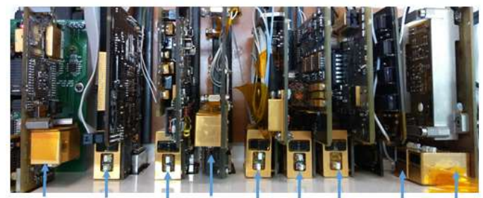
TPA EPH EPS ADCS FIBOS GMR ODM_MGM EGSE + BATTERY Fig. 3. OBCOM distribution in OPTOS satellite.