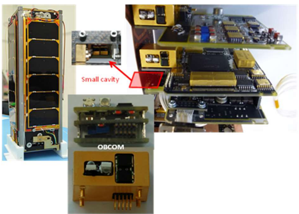
Fig. 1. View of the OPTOS satellite, distributed architecture, optical diffuse cavity and a complete OBCOM module.