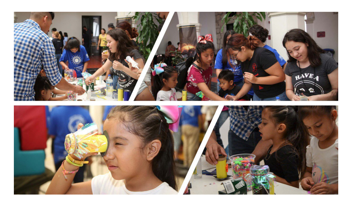
Figure 14. Kaleidoscope hands-on activity. It was constructed 100 kaleidoscopes during the event.