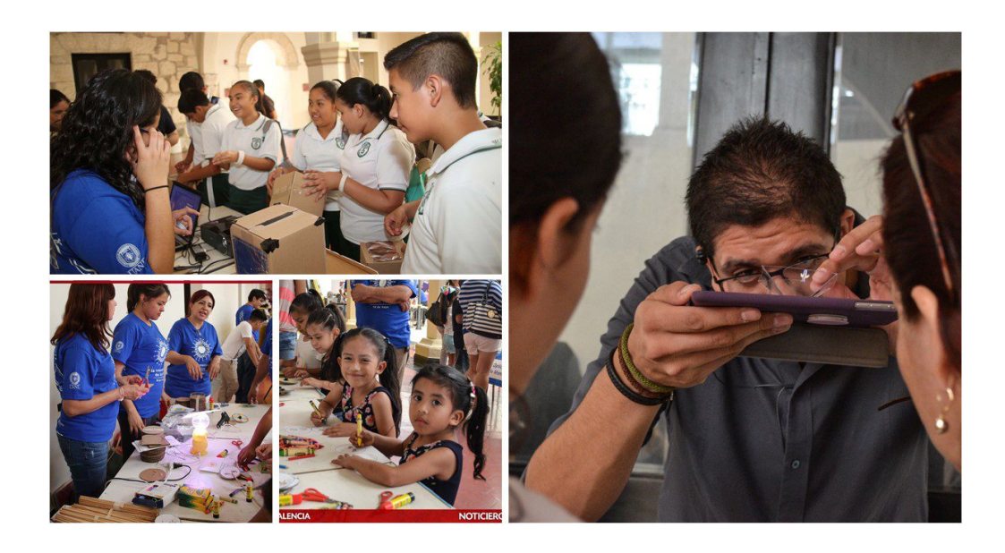
Figure 9. Hands-on activities: pinhole viewer construction, Newton's disc and pepper ghost pyramid.

explaining it. Finally, for the small children, an activity of face painting was offered, and during it, the children were asked about the things they like, about school and science-related topics with the objective of recommended to them the next activities where they could have fun. Some of these activities are shown in figure 10.