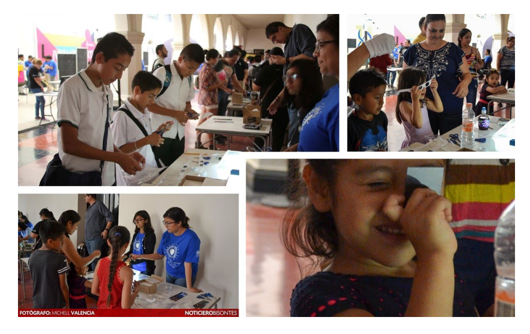
Figure 13. Polarized art demonstration. It as a very successful activity due to the beauty of polarized light.