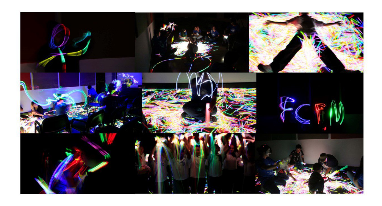
Figure 11. Light painting.