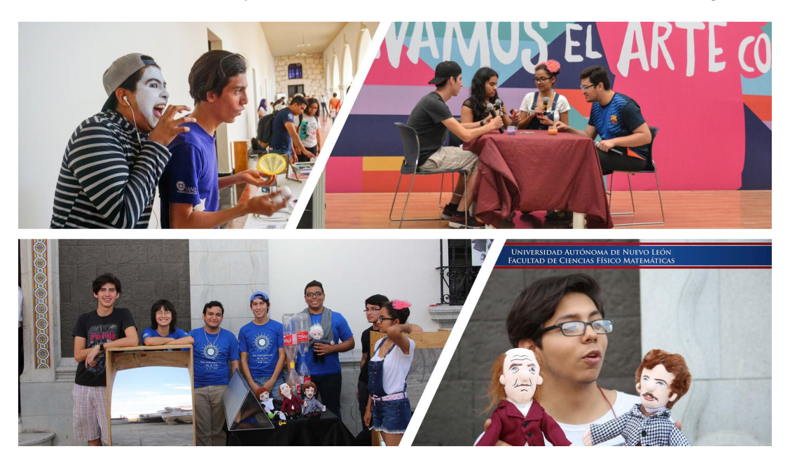
Figure 10. Cultural activities: mimes, play "The Light is off..." and plush scientists.

explaining it. Finally, for the small children, an activity of face painting was offered, and during it, the children were asked about the things they like, about school and science-related topics with the objective of recommended to them the next activities where they could have fun. Some of these activities are shown in figure 10.