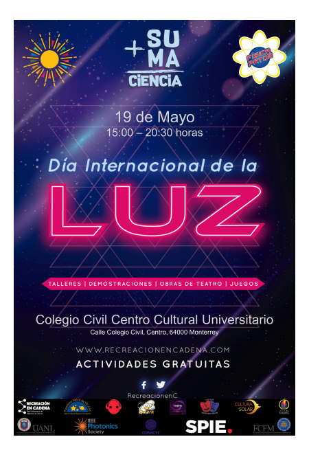
Figure 6. "Suma Ciencia – IDL in Monterrey" advertsing.