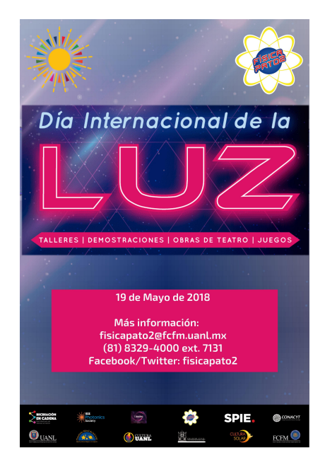
Figure 3. Press release about the IDL 2018 celebration by the UANL.