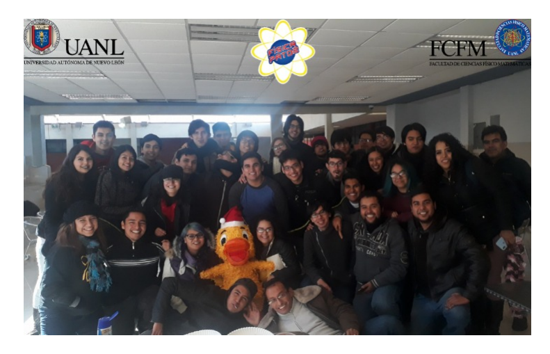
Figure 1. Some of the members of "Physics for everyone".