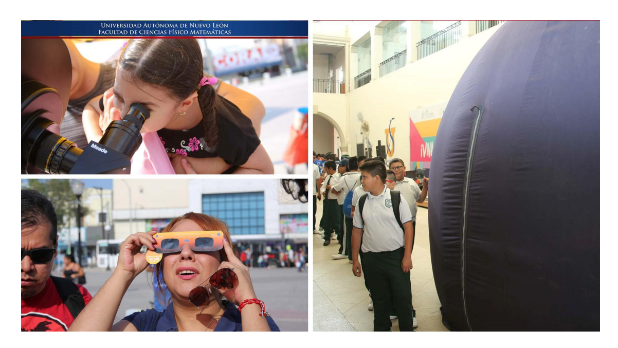
Figure 7. Solar observation, telescopes and mobile planetarium.