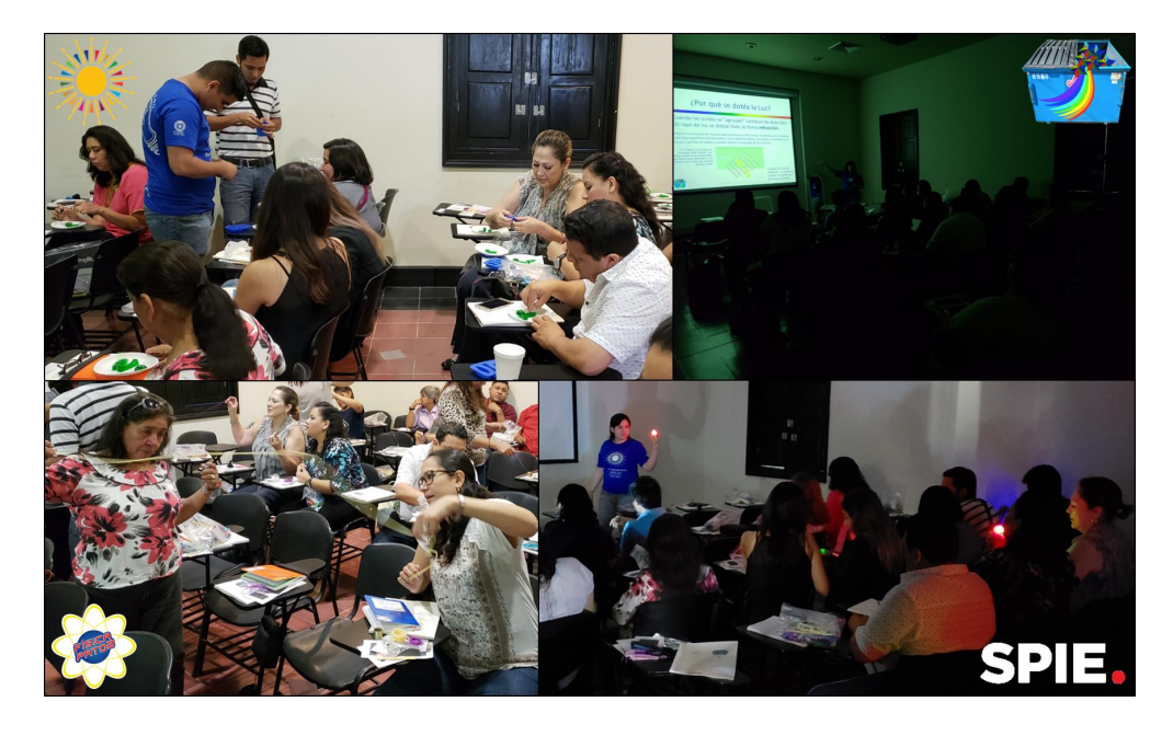
Figure 5. Teachers during the "Dumpster optics" workshop.