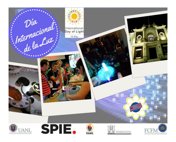
Figure 2. Advertising used during the project planning.

For the IDL in Monterrey, the group Physics for everyone in collaboration with all its partners and aligning the projects "Suma Ciencia" and "Dumpster Optics" with the IDL objectives, proposed a multidisciplinary project with different activities that allows basic-education teachers, families and, the general public to be part of a scientific, artistic and cultural event for celebrating the Light. This project called "IDL in Monterrey: science, art and culture of light", was supported by the International Society for Optics and Photonics and took place in "Colegio Civil Centro Cultural Universitario" (Monterrey Center) during May 19th, 2018. The figure 2 shows one of the first images that was shared for the advertising of the project.