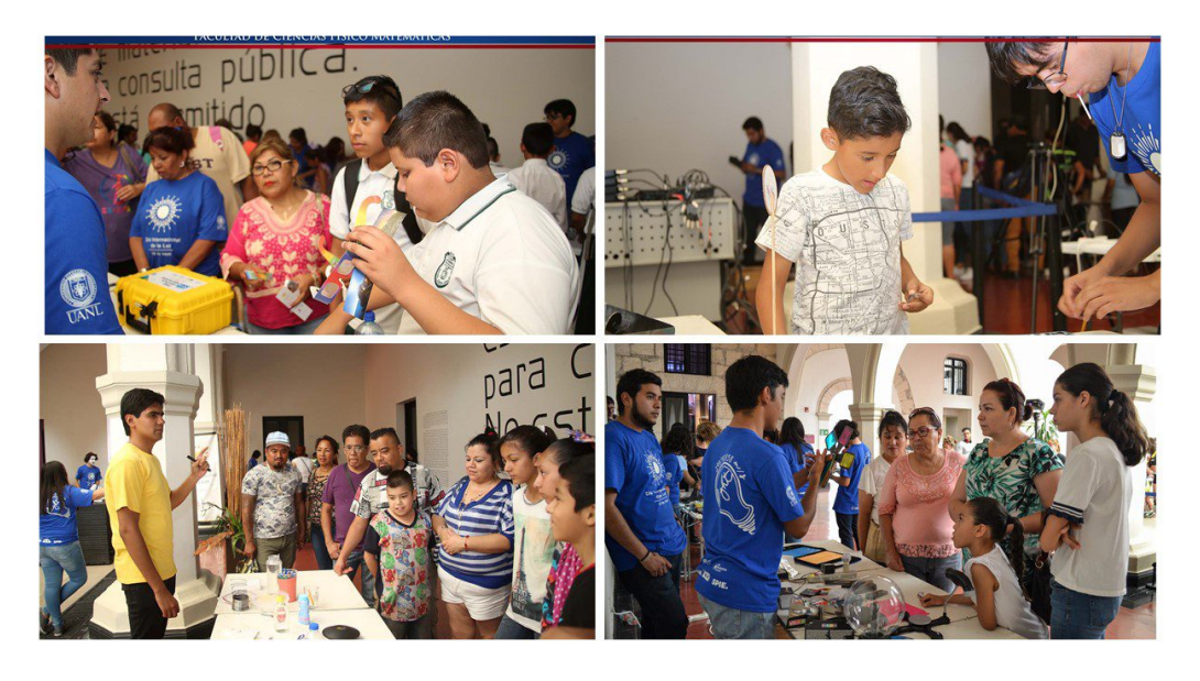
Figure 8. Scientific demonstrations performed by ITESM Student Chapter, Laniakea, Quark and Physics for everyone.

hands-on activities can be considered as STEAM activities because it is not only about science, it implies the use of creativity and the act of art appreciation (Fig. 9).