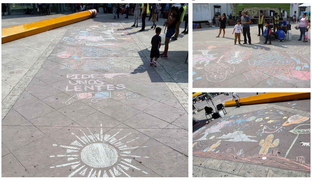
Figure 12. 3D illusions observed over a chalk paint commemorating the IDL and using chromatic aberration to create the 3D-effect.

Finally, to a complete experience related with science, the complementary science outreach activities by the "Divertimatematicas" and "Robotics FCFM - UANL" allowed the families and the public to learn that Math and Robotics are also science and learn it is also fun and exciting.