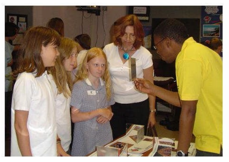
Figure 3: Parent, children, and postgraduate volunteer carrying out some reflection experiments with mirrors