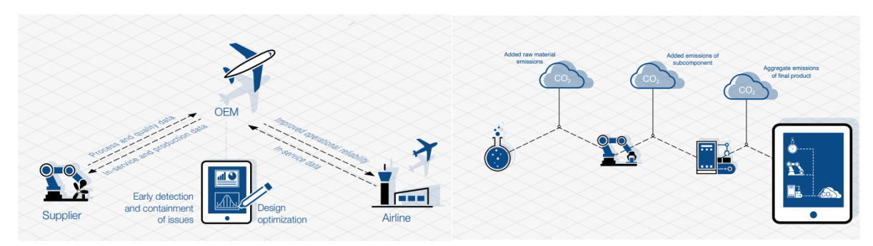
Figure 3. How transforming the manufacturing and supply systems might work [7].

Some other "food for thought" is that AM and intelligent processes will help address the labor shortage. Call this "Smart Manufacturing," if you will. Automation of many manual processes can now take place in "Smart Factories" using more digital tools, robotics, and machine learning/AI all add value and improve efficiencies, as well as drive down the carbon footprint, Figure 3 [7]. Other ethical considerations concerning labor and working conditions for people in the supply chain may also be addressed.