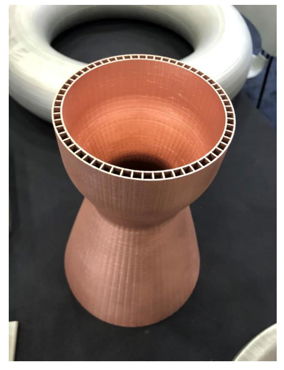
Figure 6. GR Cop 42 copper alloy rocket nozzle demonstrator processed by LMD using a green wavelength.

Innovations have been able to utilize a green laser optic combined with their LMD system to produce full size copper alloy nozzles. Laser AM is a welcome alternative technology for these materials.