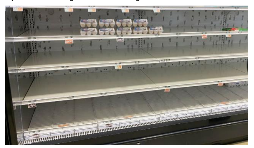
Figure 2. Bare shelves in 2020 due to coronavirus panic shopping [3].

Three years after the height of the pandemic, supply chain issues are still affecting many facets of life here in the United States. A number of crises have caused worldwide shipping delays. For example, in 2021, when a vessel was stuck in the Suez Canal, thousands of unloaded shipping containers remained stranded in the port of Los Angeles, resulting in shortages of many items normally produced in China and other Asian countries, most famously it led to a shortage of the tapioca pearls, or boba, used for making boba tea [2], as well as shortages of other materials needed to produce consumer products and parts such as silicon chips and computer control systems. And of course, everyone remembers the general lack of food items on shelves in stores, Figure 2. In the face of increased anxieties resulting from recurring shortages, the question becomes, how do we get goods and products to customers and end users, and how do we overcome the lack of manpower, skills and general labor shortage?