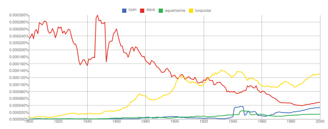
Figure 4. This diagram illustrates how cyan is not the best term for RGB = (0, 1, 1) and we should use the term turquoise instead.

1800 to 2000. The diagram suggests that to be aligned with fellow English speaking people, we should use the color term turquoise instead of cyan . Of course, in the case of the process ink, we should still use the term cyan .