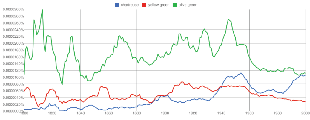
Figure 5. Is the term for RGB = (1, 1, 0) monolexemic?

We can use the crowd-sourcing approach also to answer very difficult questions, like the number of basic color terms. The diagram in Fig. 5 illustrates that the color between yellow and green might be becoming a basic term also in English like it is in far eastern languages, because chartreuse is monolexemic and is replacing olive green .