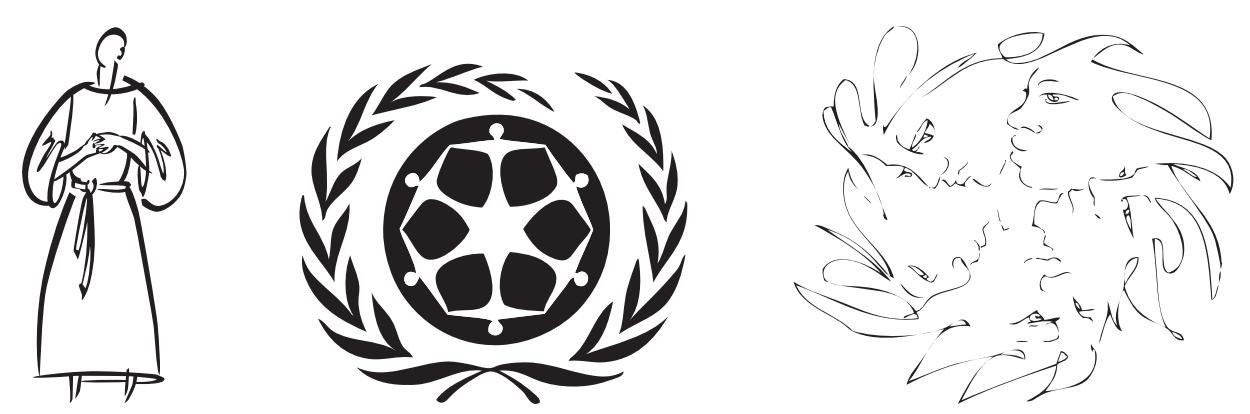
Figure 3. In the western culture the hero is the individual, while in the far east it is the people in harmony, as shown in Unesco's logos of the population world year (id 20004489) and the cultural development decade (id 20006215), ©Unesco.

Due to the data size, manual inspection of individual responses is not an option. In a recent paper<sup>20</sup> we described how to effectively and efficiently perform a laboratory validation of this large scale uncontrolled Web data, following Zuffi et al.<sup>21</sup>