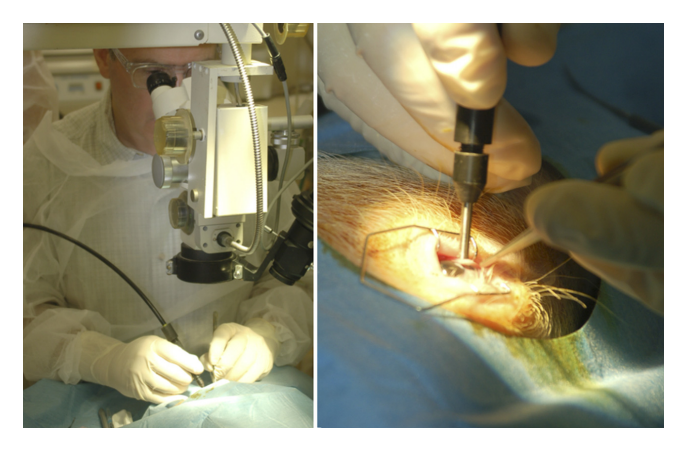
Fig. 1 The laser soldering protocol, using the laser soldering system.